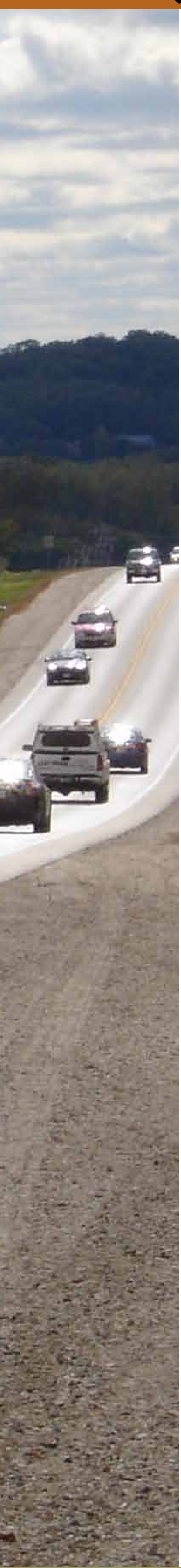
2-Lane Limited Intersection Improvement